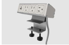
Fola 3 power, 1 USB-A+C Silver anodized aluminum with matte white finish, white cord