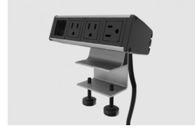
Fola 3 power, 1 open data Silver anodized aluminum with matte black finish, black cord