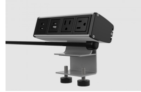
Fola 2 power, 1 dual USB-A, 1 dual USB-C 45w. Silver anodized aluminum with matte black finish, black cord