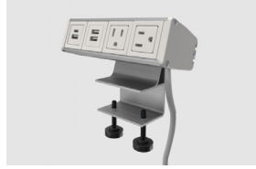
Fola 2 power, 1 dual USB-A, 1 USB-A+C Silver anodized aluminum with matte white finish, white cord