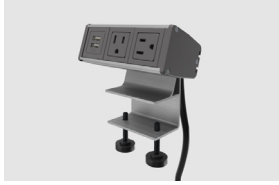
Fola 2 power, 1 dual USB-A Silver anodized aluminum with matte storm finish, black cord