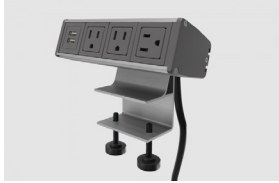
Fola 3 power, 1 dual USB-A Silver anodized aluminum with matte storm finish, black cord